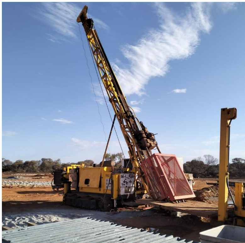
Figure 1: Topdrive Drillers Australia onsite at McTavish East.