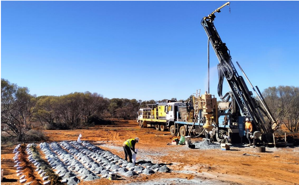
Figure 1 , Challenge Drilling RC rig onsite at Kookynie Gold Project

Carnavale Resources Ltd (CAV) is pleased to announce it has completed a program of RC drilling at McTavish East at the Kookynie Gold Project following up on strong, extensional high-grade gold results from previous shallow aircore drilling in the regolith.