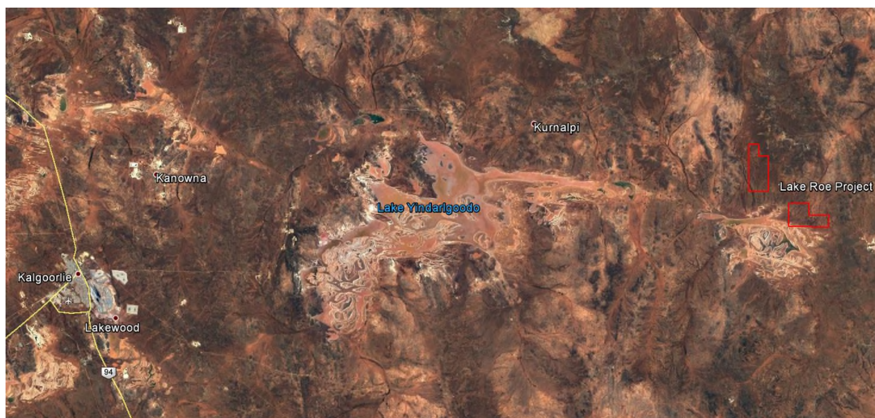
Figure 1 Lake Roe Project location plan

Magnetic and gravity datasets suggest the Stag Prospect occurs on the eastern limb of a folded dolerite/schist sequence associated with a SE trending second order structure. This SE trending structure has not been tested a further 3km strike length to the SE. Other second order structures, potential differentiated dolerite and BIF targets and a moderate sized granite occur elsewhere in the tenement. Previous RAB and aircore drill is estimated to have tested only approximately 20% of the tenement area, providing scope to expand on the known Stag anomaly.